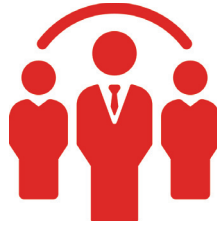
Political Action Committees