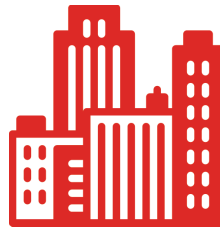
State, District & Local Parties